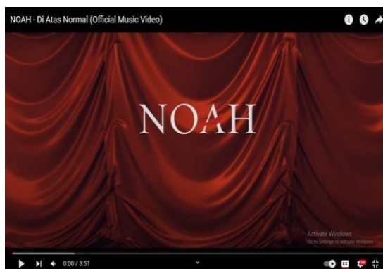
Figure 2. Video Minutes to 00.00

In scene picture 2, the video at 00.00 minutes shows a red curtain with Noah written on it. The meaning is that Noah's grub band will give an interesting performance from the comedian actors in the video clip.