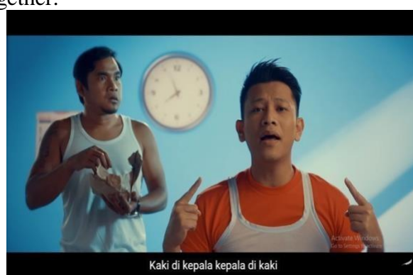
Figure 6. Video minutes 00.19

Figure 5, video minutes 00.18, this scene has 2 people. One of the 2 people's legs turned on the head. Then at 00.19 minutes, another person was shocked after witnessing the incident. Its meaning is someone who has lost his mind because his love has long gone and expects his presence to come back together.