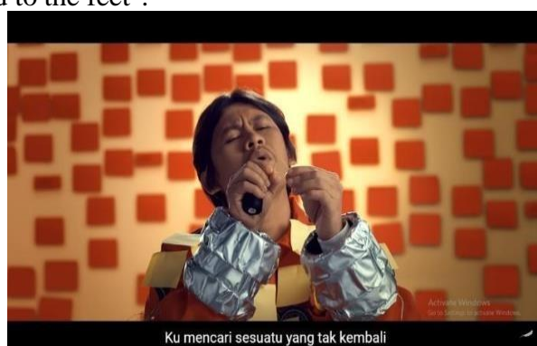
Figure 7. Video minutes 01.46

Figure 6. Video at 00.19 minutes, he realized that this was something wrong, but he still thought about it so that someone became confused. Therefore, the lyrics for this part of the song are "feet to the head, head to the feet".