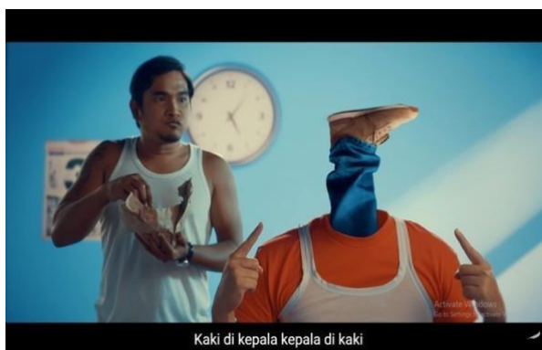
Figure 5. Video Minutes 00.18

Figure 5, video minutes 00.18, this scene has 2 people. One of the 2 people's legs turned on the head. Then at 00.19 minutes, another person was shocked after witnessing the incident. Its meaning is someone who has lost his mind because his love has long gone and expects his presence to come back together.