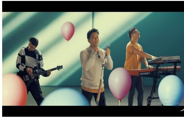
Figure 8. Video minutes 02.51

Scene picture 8, video 02.51 minutes showing the band Noah and there are 2 blue balloons and 3 purple balloons, but one of the purple balloons flies. Then, the background is blue. The meaning is that he must be able to let go of his lover in the past because unconsciously it is holding him back in life. In addition, if he lets go of his lover, then he will throw away his sadness, feel the calm and joy that has been hidden by his sadness.