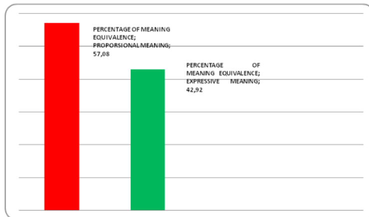
Figure 2. Non-Equivalence in Meaning Percentage

Based on the table and chat above, the results of meaning non-equivalence are explained below: