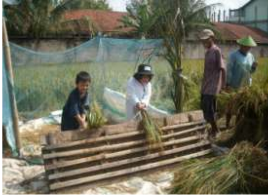
Picture 1: The students joining the farmers in the farm (outing activity)

The school curriculum implements multilingual in daily communication. Bahasa Indonesia, English language and Javanese Language are used in daily interaction. English language is aimed as a strategy to face international events and communities, while Javanese Language is aimed to prevent mother tongue and local content. Actually, the students are also introduced to Arabic Language on Friday, but it is not implemented in daily communication yet.