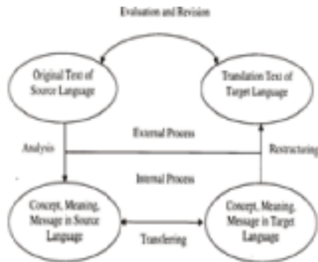
Figure 1: Translation Process.

Translation covers two areas, product of translation and process of translation. Those two areas are interconnected each other. Translating is not simply as reading the original text, opening dictionary and rewriting the expression into target text. It is the old assumption in translation. Translation needs some process to gain the accurate translation. According to Larson (1984), the process of translation can be drawn in the following picture: